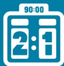
SCOREBOARDS AND SIGHTSCREENS