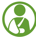
PERSONAL ACCIDENT (FOR INDIVIDUALS)